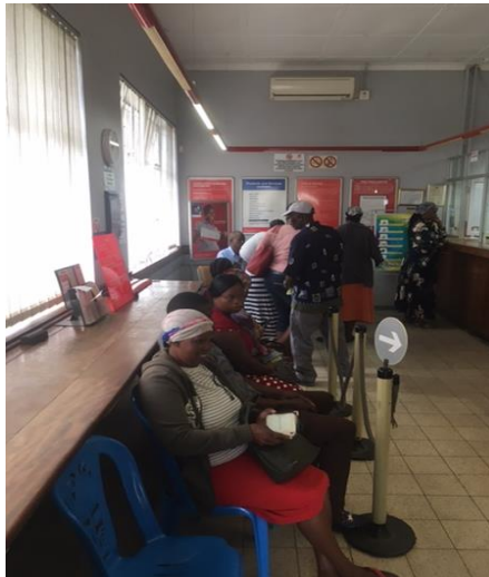
Photo 11: Queue inside building with verification process in the corner at the end of the picture.