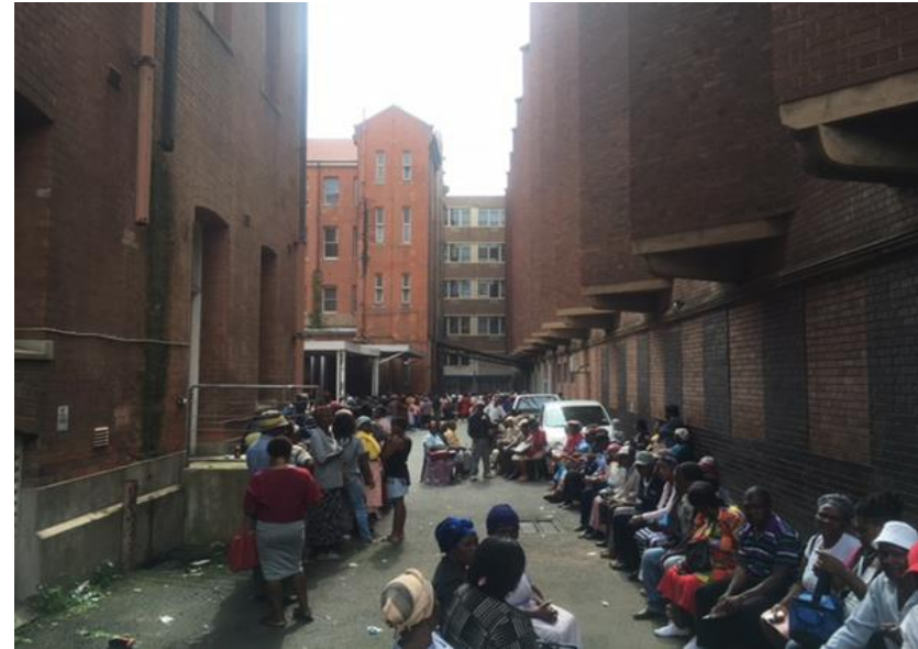
Photo 2: Extended overflow from Tent right around the back of the Post Office