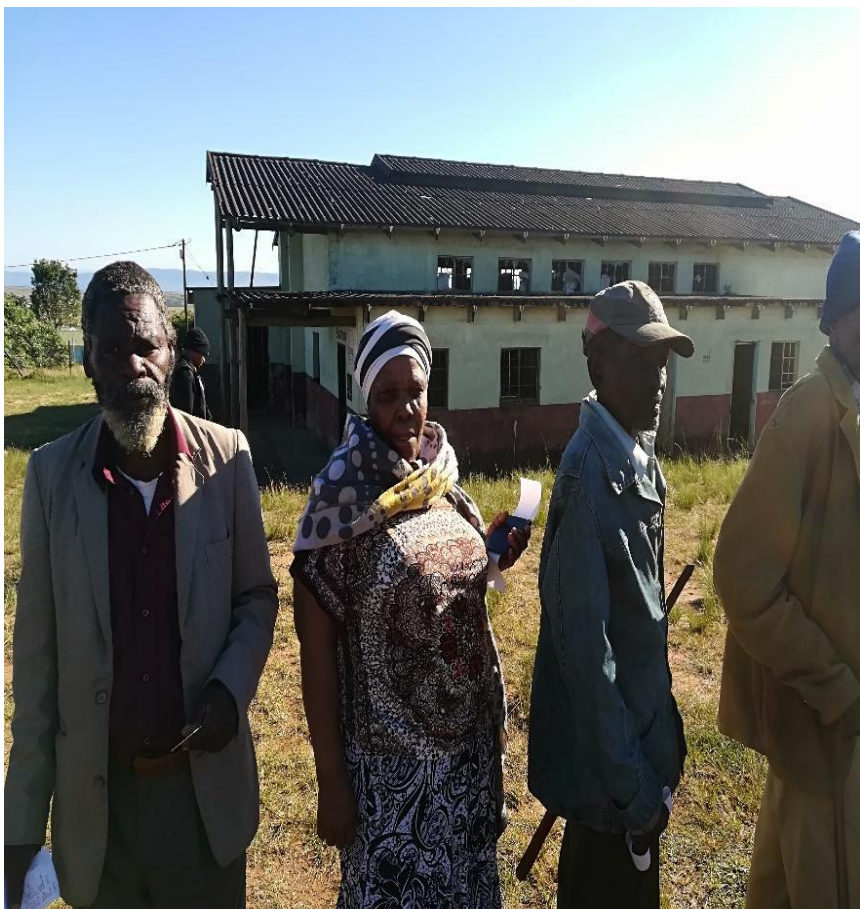
Photo 19: Beneficiaries standing in front of the abandoned, vandalised building being used as the pay point