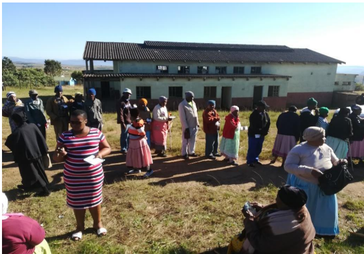
Photo 17: Beneficiaries waiting outside in the sun, without seating or shelter