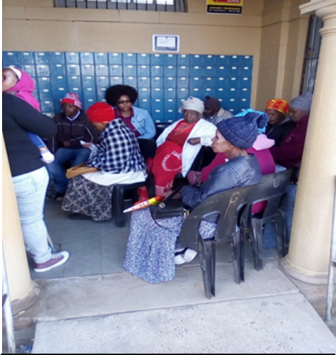
Photo 3: Grant beneficiaries using the postal box area as additional shelter.