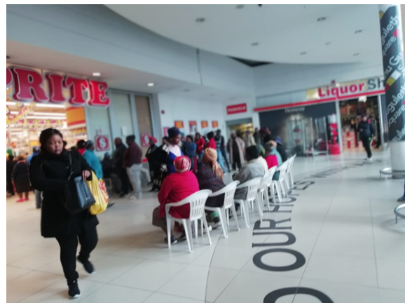
Photo 4: Beneficiaries waiting to access their grants at Shoprite.