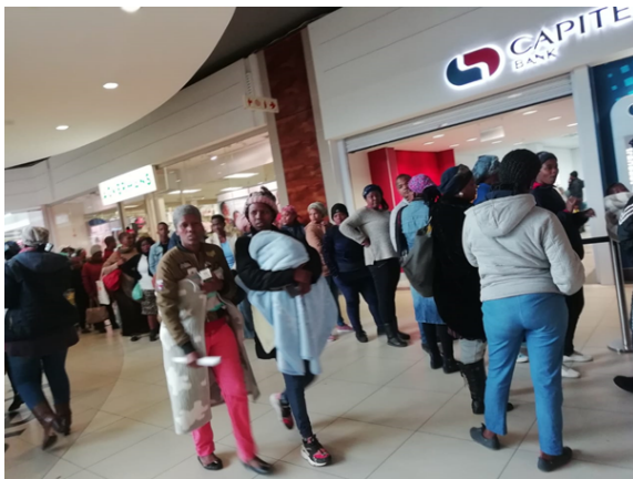
Photo 3: Long queues inside Gugulethu Square. Beneficiaries waiting to access grants at the ATM.