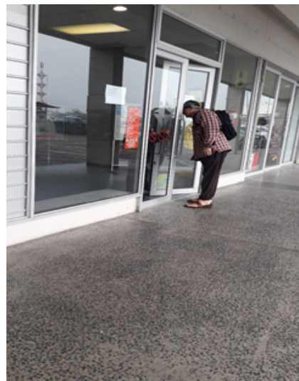
Photo 2: A beneficiary peek through the door to ask why the SAPO is closed during operating hours. This photo was taken at 10h30 on 19 July 2019.