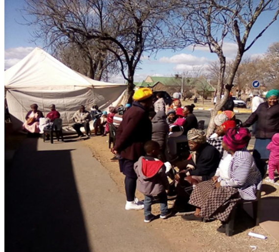
Photo 4: SAPO Cathcart provided 55 chairs, however 25 grant beneficiaries were standing and sitting on the floor.