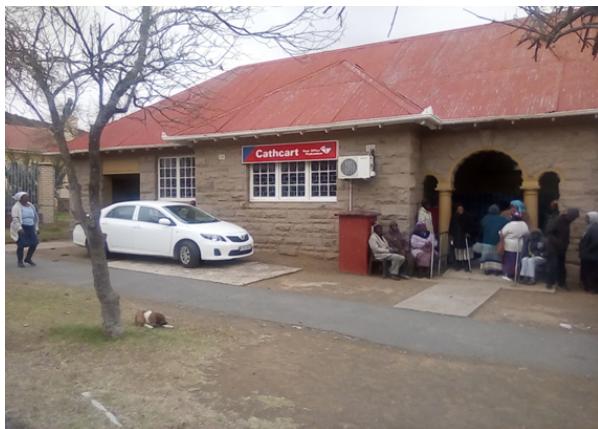
Photo 1: The unbranded vehicle driven by the woman assisting with payment verifications.

The monitoring team reported that no mashonisas or loan sharks were spotted near the payment site. The team did observe a branded vehicle down the road collecting funeral insurance money from beneficiaries.