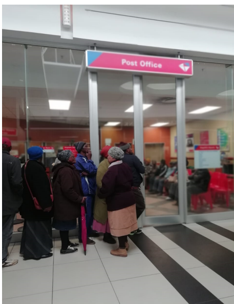
Photo 5: Beneficiaries queueing outside of the SAPO branch even though there are empty chairs inside.