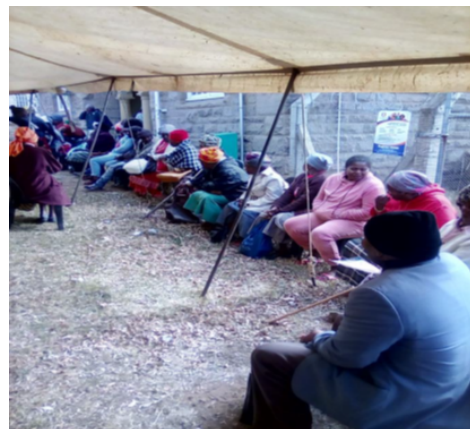
Photo 2: Grant beneficiaries waiting under the marquee tent on 1/8/19. No water facilities were available.