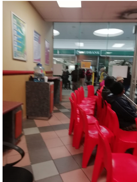
Photo 2: A water dispenser with foam cups, chairs for beneficiaries and posters against the wall.