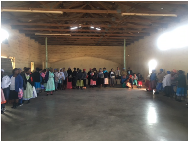
Photo 3: Beneficiaries queuing inside Thandabantu Hall before the Arrival Of Chairs.