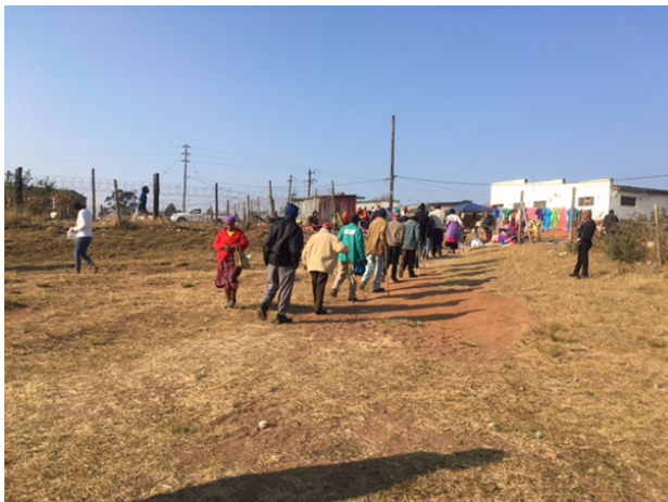
Photo 5: Beneficiaries being led to Senzokuhle General Dealer Store for Verification.