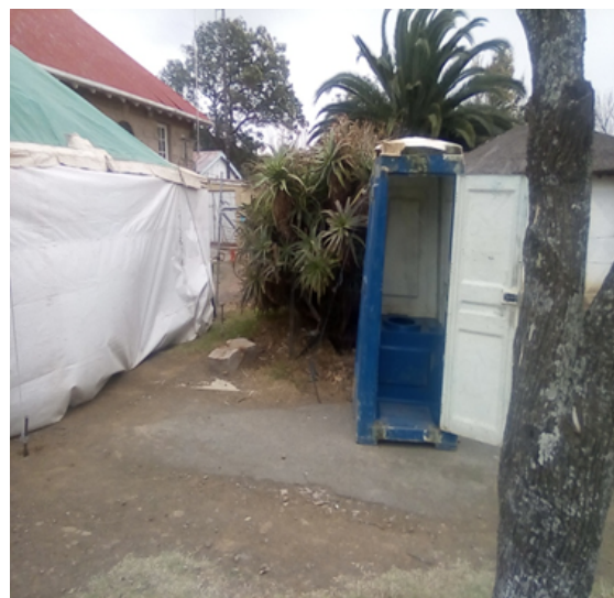
Photo 8: One portable toilet was provided for female, male and disabled beneficiaries on 1/8/19. This had been removed with the marquee tent on 2/8/19.