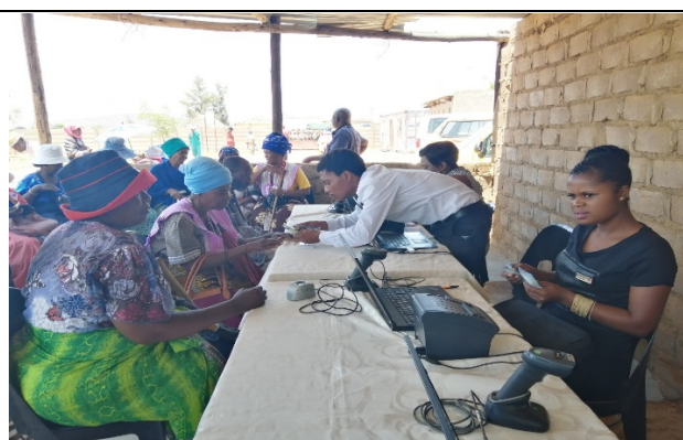
Photo 3.6.4: An example of a teller counting out money for a beneficiary.