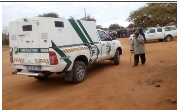
3.3.1: Security vehicle used to dispense cash arriving at the paypoint venue.