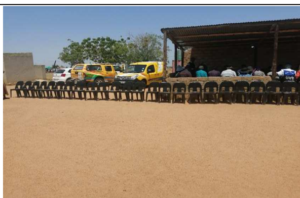
Photo 3.6.1: SASSA and SAPO cars that serves as offices and Help Desk. The beneficiaries sit on the chairs, with no shelter. The temperature was above 34 degrees Celsius on this day.