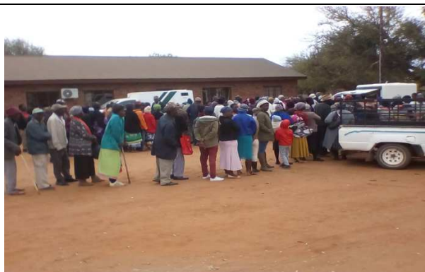
3.3.2: Ga Mamadi Beneficiaries queuing outside the hall for cash collection