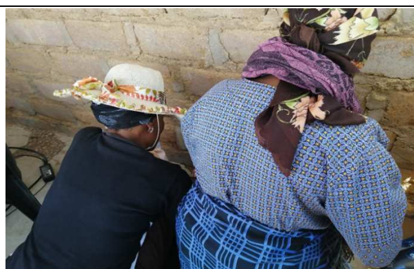
Photo 3.6.2: Grant beneficiaries counting their money in the corner, on the floor, after getting paid.